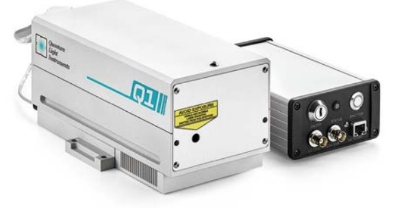
Laser head Q1 with controller unit