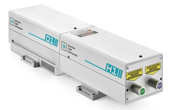
Laser head Q1 with attached harmonic generator module H1